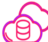
Image Informatics Accelerating dissemination & adoption of best practices

Diversity, Equity & Inclusion Education, awareness & support for under-represented groups